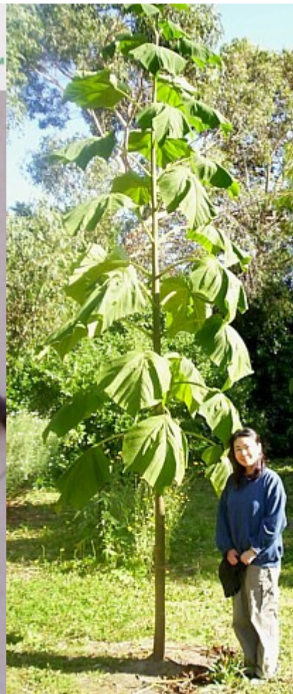
TGG Headstarters™ can reach this size in just 5 months after planting!